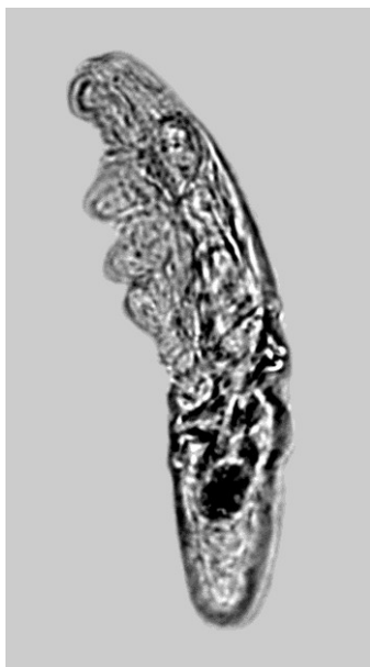
Fig. 3. Demodex cornei