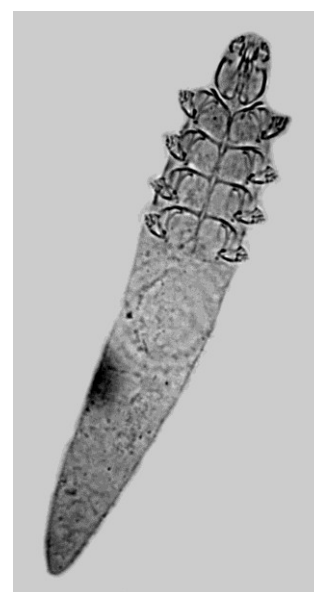
Fig. 2. Demodex canis .